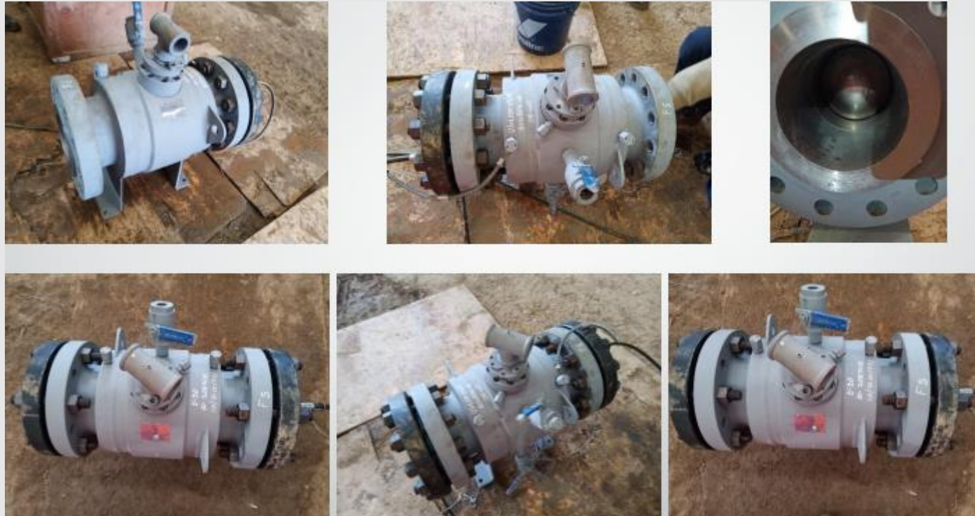
P.H. ON BODY AND SEALS OF 6 INCH CLASS 600 BALL VALVE