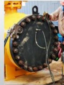
P.H. A 24" CLASS 600 BALL VALVE