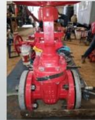
P.H. BACK SEAT AND BODY IN 4" GATE VALVES CLASS 150