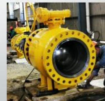
P.H. A 24" CLASS 600 BALL VALVE